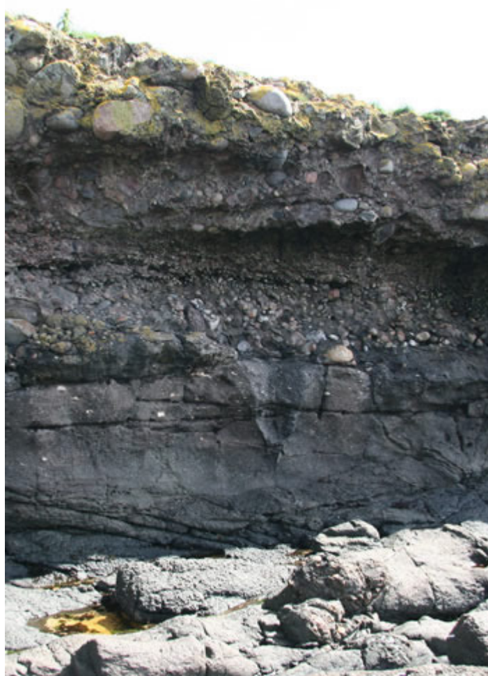
Coarse conglomerates of the Crawton Group of the Lower ORS resting on the third lava of the Crawton sequence at locality 3.