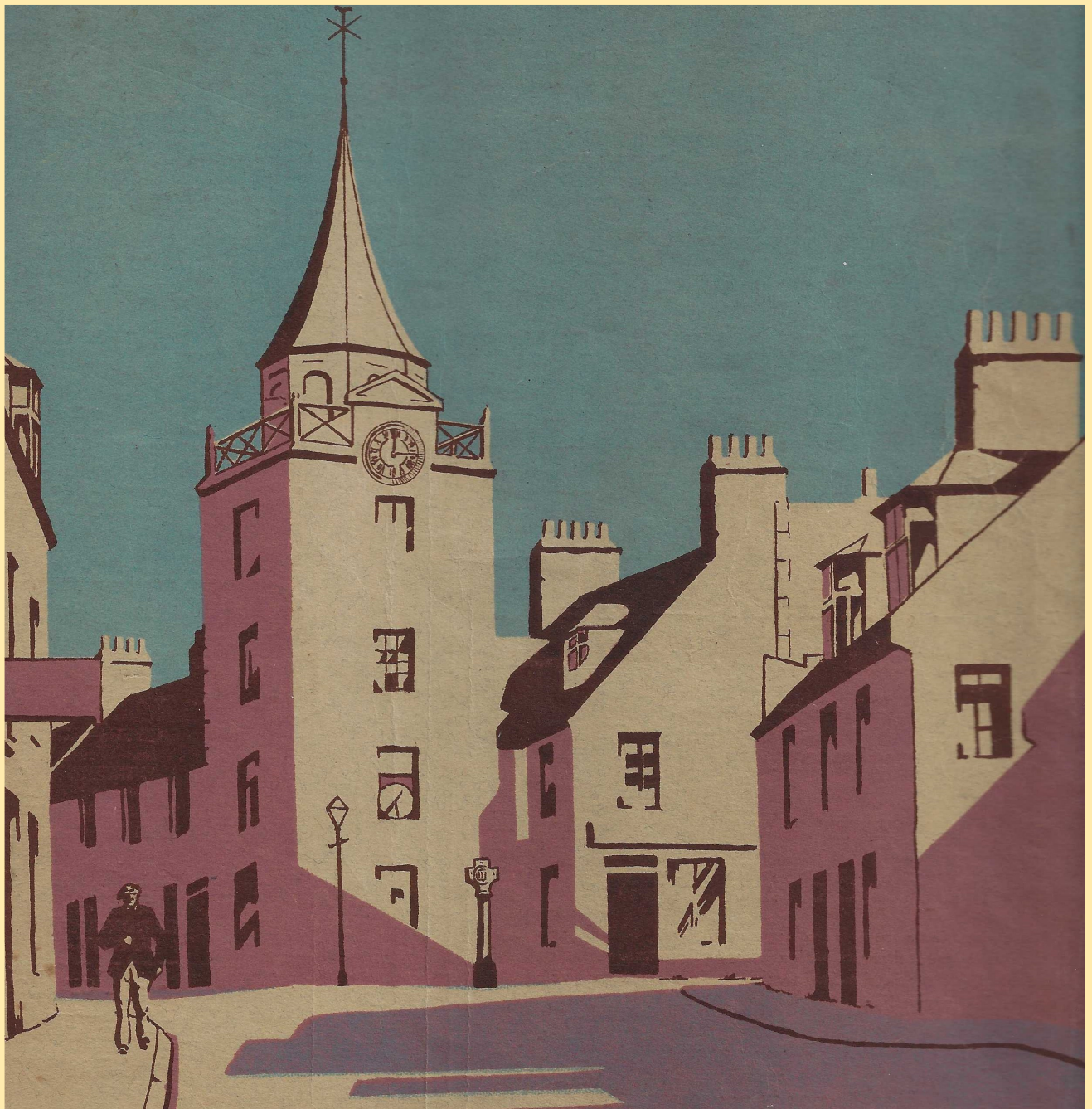
Drawing of the Old Town Steeple from around 1930