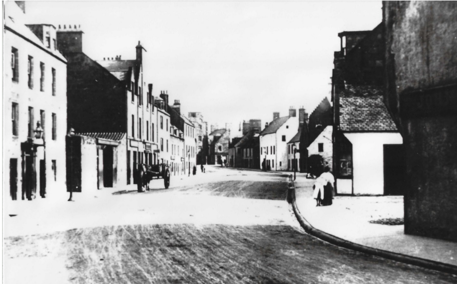
Around 1900, a quiet High Street, Stonehaven. Christian's House is on the left and the white house on the right in the centre is the House of Ogilvy of Lumgair, both still standing.