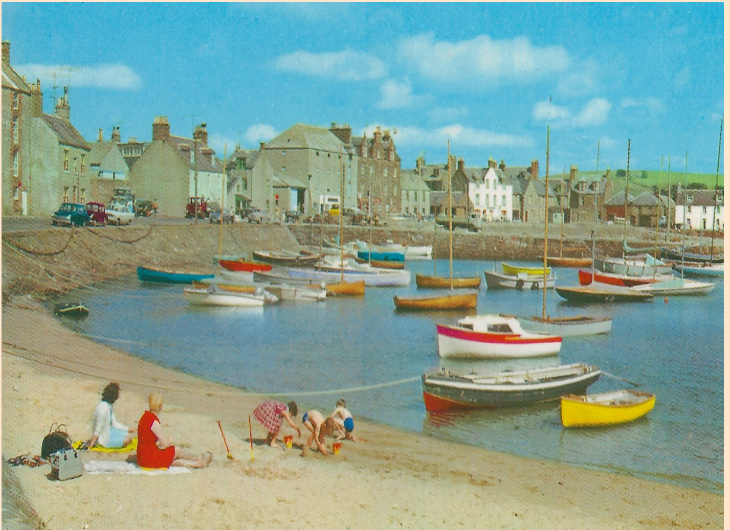
Stonehaven Harbour Taken from a 1960's postcard